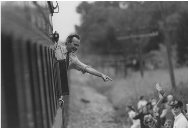
9. President George H. W. Bush waves from the back of the train outside Bowling Green on a whistle-stop campaign trip through Ohio in September 1992.