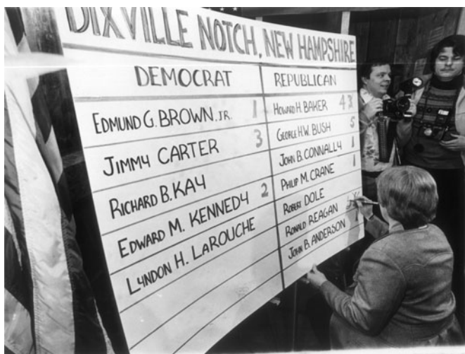
8. Officials tally votes at the presidential primary in Dixville Notch, New Hampshire, traditionally the first town in the state to report its results.

caucuses have opened the official nominating season. Leading candidates tend to concentrate on these contests, giving those states significant influence, many argue too much influence for states that are unrepresentative of the nation as a whole or of the supporters of either party. 11 States, either acting on their own or in consort with other states from their same region, have moved their primary or caucus dates to early in the process in order to increase the attention paid to their contests. As a result, the entire nominating process is “front-loaded.” In 2004 more than three-quarters of the delegates were chosen by April 1, four months before the convention. As a result, Senator John Kerry had amassed enough pledged delegates to assure himself the nomination by March 13. 12 Therefore, citizens in states holding primaries after that date had absolutely no influence on whom their party would nominate. 13