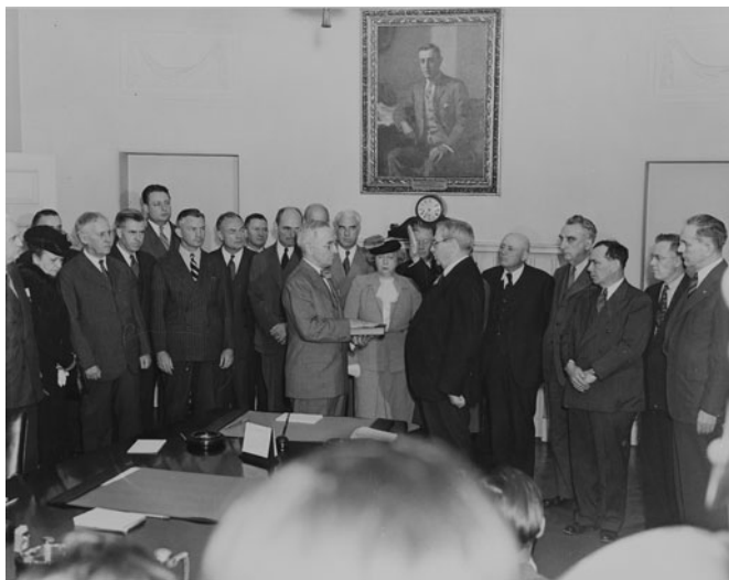
1. Harry S Truman takes the oath of office as president of the United States in the Cabinet Room of the White House, following the death of President Roosevelt in April 1945.

President Franklin D. Roosevelt was reelected in 1944; a campaign was run despite the fact that we were engaged in World War II. When he died in April, 1945, his little-known vice president, Harry S Truman, succeeded him, leading the nation in the war effort and postwar period without facing the electorate until November 1948. Congressmen serve fixed two-year terms and U.S. senators,