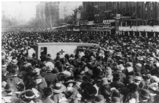
7. A woman suffrage procession makes its way through the streets of Washington, DC, on March 3, 1913. The expansion of the franchise had the potential to double the size of the electorate.

The third stage in the expansion of the franchise was extending the vote to women. The epic battles waged by women suffragists, from the Seneca Falls convention issuing its Declaration of Sentiments regarding woman rights in 1848 through ratification of the