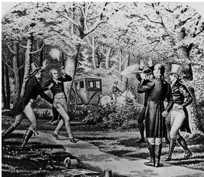
4. The heated political rivalry between Aaron Burr and Alexander Hamilton ended in a duel at Weehawken, New Jersey, on July 11, 1804.

Fourth, in 1800 the incumbent president lost the election and eventually conceded, though it would have been possible for him to stay in power through manipulating the House of Representatives. When Adams voluntarily turned over the power of the presidency to Jefferson, the legitimacy of the new nation's political system was assured; and the role that parties were to play in that system demonstrated a primacy without precedent.