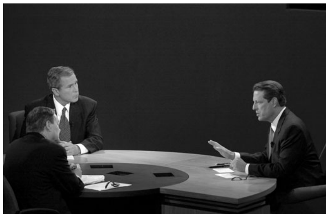
10. Moderator Jim Lehrer and George W. Bush listen to Democratic candidate Al Gore as he answers a question during the presidential debate in Wait Chapel at Wake Forest University in October 2000.

A great deal of money will be spent in the general election. We know that the two parties will receive tens of millions from public funding. What we do not know is if the candidates will accept money or run using private funds, thus avoiding any limitation on spending. We know that the national political parties and others will contribute as well; but we do not know how they will do so, how much they will spend, and what effect that spending will have.