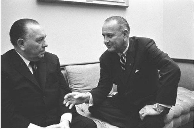
6. President Lyndon Johnson pays homage to Chicago's longtime political boss, Mayor Richard Daley.

Parties, however, did not disappear. If parties as campaign organizations were on the wane, parties as a means to organize the government and as a symbol to which citizens showed loyalty remained strong. 8 In the early twentieth century both parties, in both houses of Congress, began to elect formal leaders, whether the party held majority or minority status. Party members in legislatures were expected to follow their leaders. The party of the president was expected to support that president's legislative program. Newly elected presidents routinely chose members of their own party to fill cabinet and subcabinet jobs.